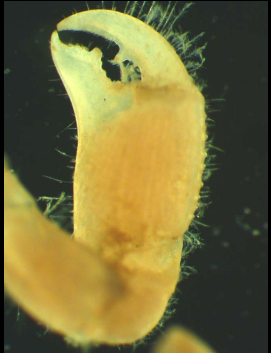
Male Pinnixa sp.