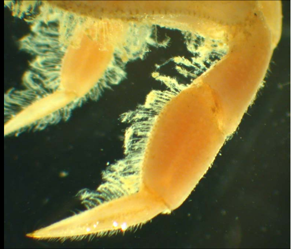
Male P. occidentalis