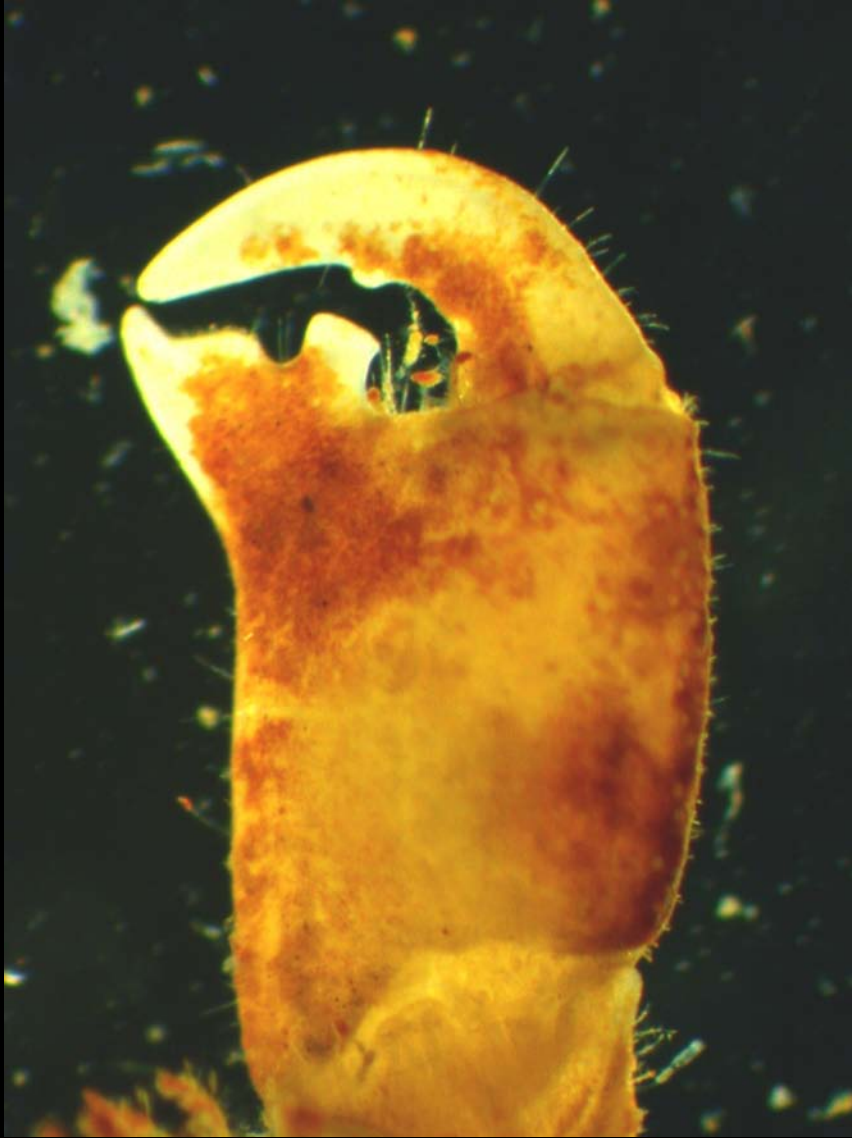
Male P. occidentalis