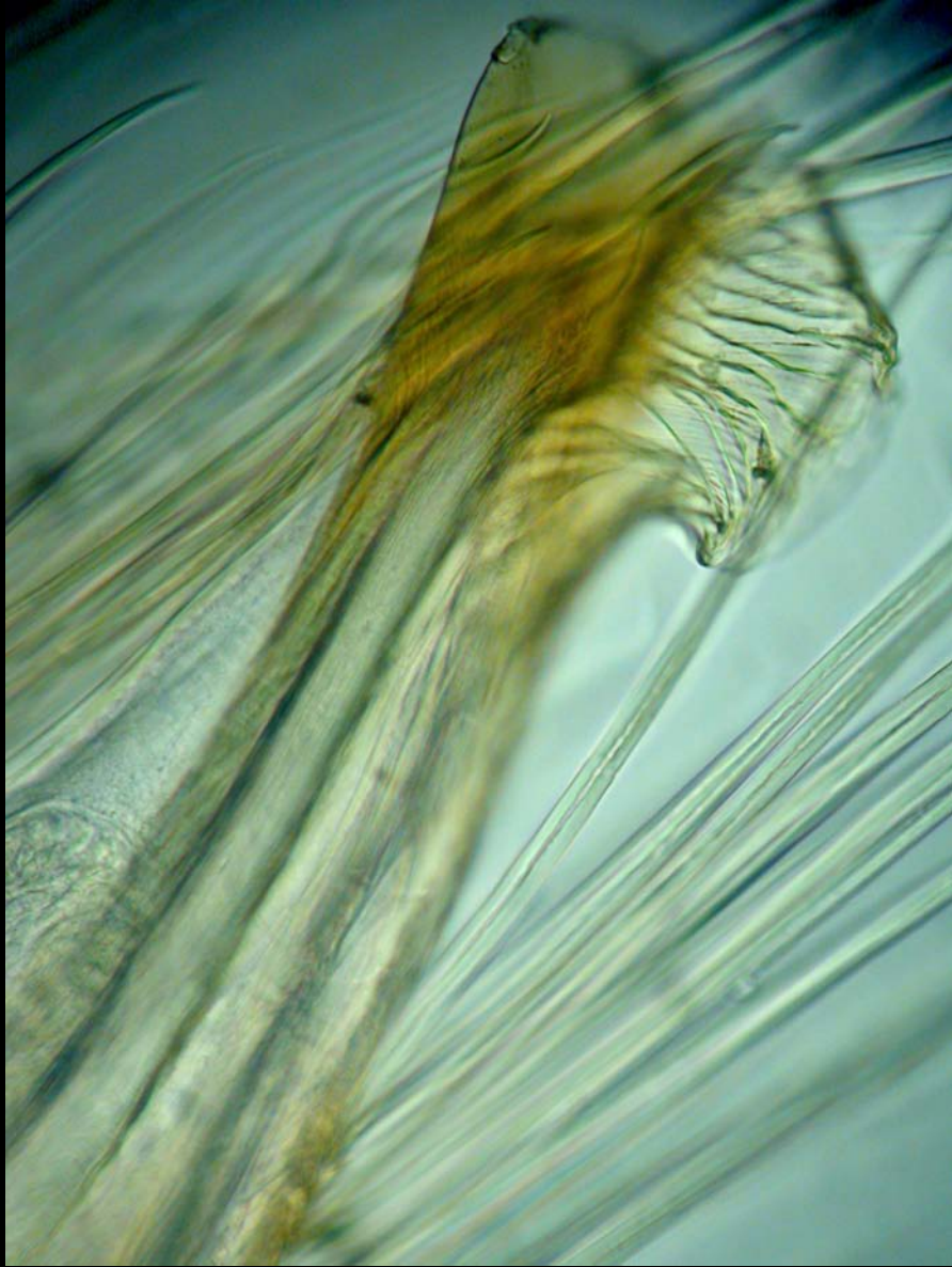
Male P. occidentalis