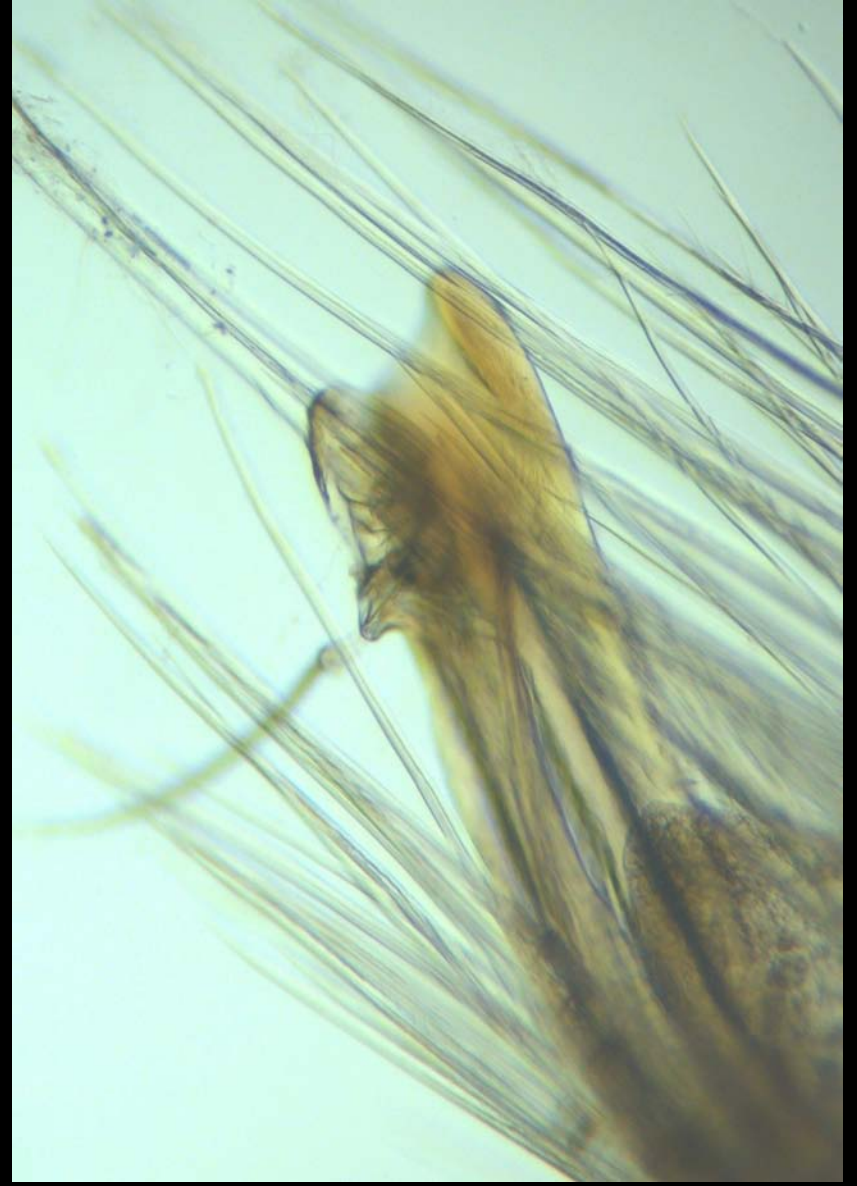
Male Pinnixa sp.