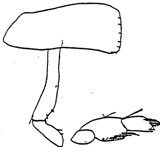
Figure 3. Gnathopod 2