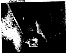
Figure 5 - Pista alata

DISTRIBUTION: Central and southern California; intertidal and shelf depths.