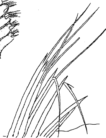
Fig. 2 — Modified postbranchial neurosetae, 1000X

Comments: (modified from an unpublished draft of a SCAMIT voucher sheet by L. Lovell and K. Barwick)