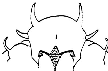
Fig 3. (Hartman 1968 p. 579)