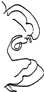
Fig. 2 a (Hartman 1968 p. 577)