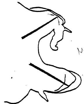
Fig. 2b (Hartman 1968 p. 589)