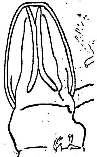
Fig. 3 Magelona riojai