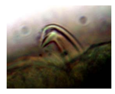
Figure 3. abdominal hooded hook (oil emersion)