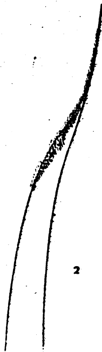
Figure 2 (from Hartman, 1969)