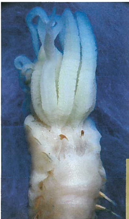
Specimen City of San Diego Regional Survey 2138 rep1 15July96 191m.