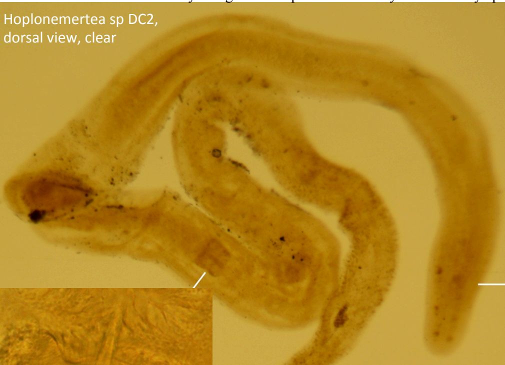
Hoplonemertea sp DC2, dorsal view, clear