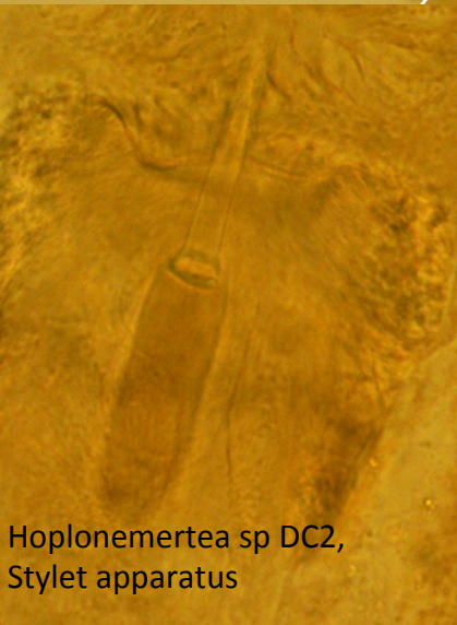
Hoplonemertea sp DC2, Stylet apparatus