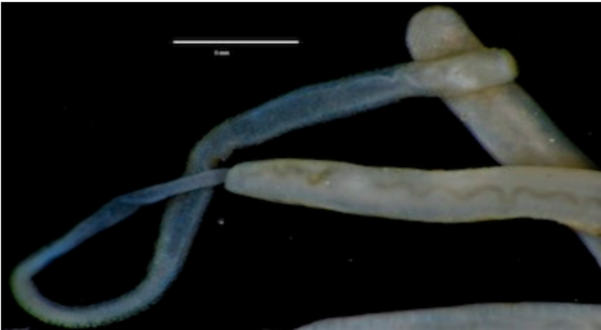
Figure 1. Amphiporus cruentatus (uncleared) 17 mm. Goleta B6(1), 30 m, 7 October 2008. * cerebral blood vessal visible as light brown squiggly line