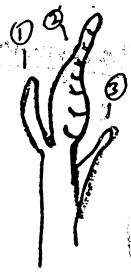
Ceriantharia sp. Q