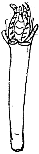
Ceriantharia sp. C