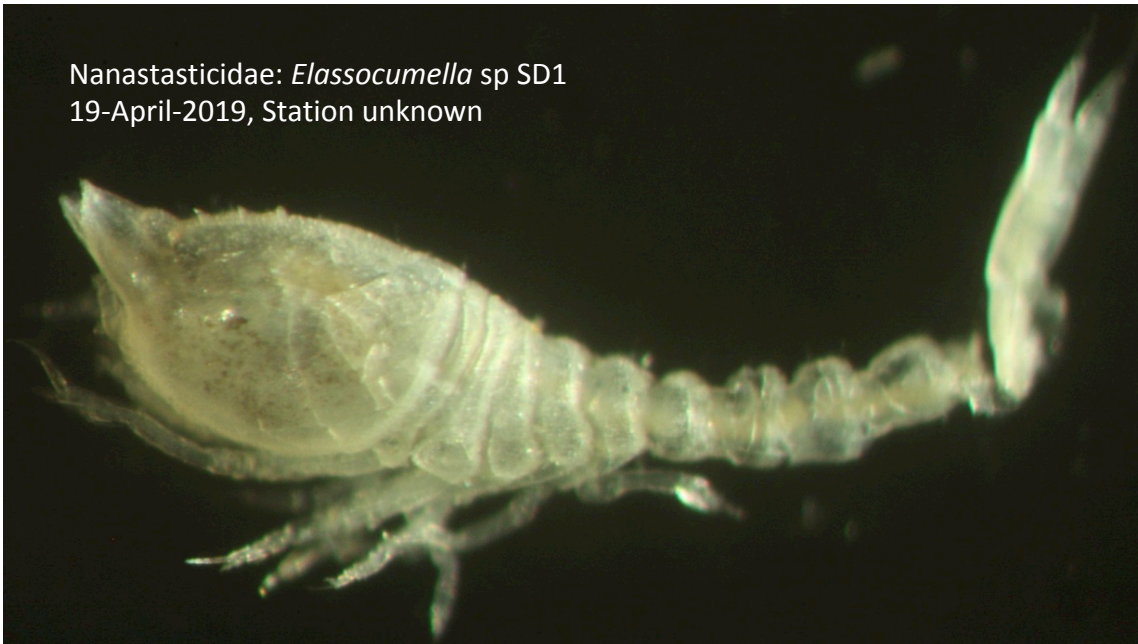
Nannastacidae: Elassocumella sp SD1 19-April-2019, Station unknown

Notes: Cadien 2021 provides a brief but detailed commentary on the history and current status of Elassocumella .