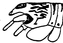
Fig. 2. Head.