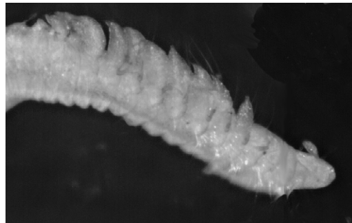
Lateral view of anterior end showing median antenna and branchiae (Bight'98/981119)