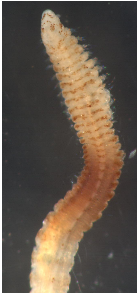
Ventral view of anterior end (CSD/P-70)