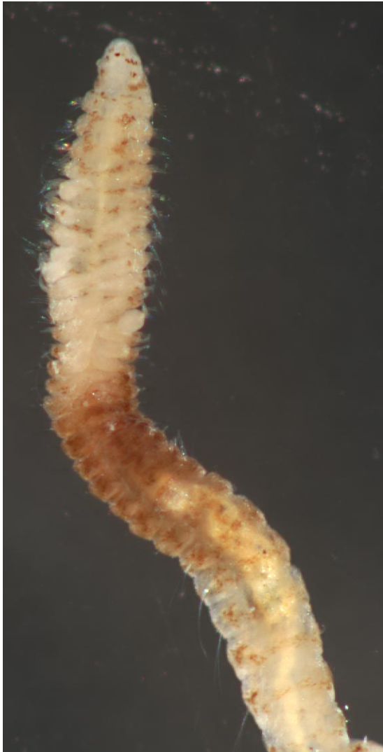
Dorsal view of anterior end (CSD/P-70)