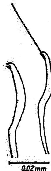
fig. 2 Strelzov, 1973