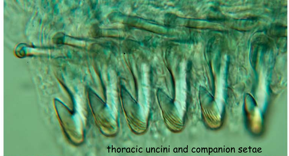
thoracic uncini and companion setae