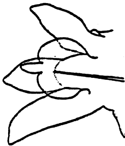
Fig. 1 (Hartman, 1968: p. 643)

Comments: Occurs in low intertidal zones to 550 meters.