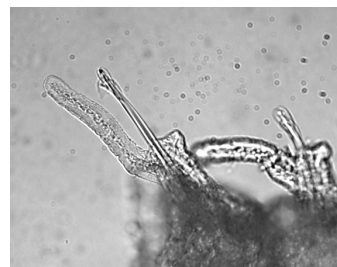
Figure 3. Posterior segments.